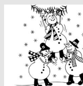
Hanging of the Greens

Christmas Worship Festival – LNPC is presenting its 5 th annual Christmas Worship Festival on Saturday, December 5 th at 7:00 P.M. and Sunday, December 6 th at 4:00 P.M. Please obtain your tickets early and invite your neighbors! Tickets are available on the Patio and in the office.